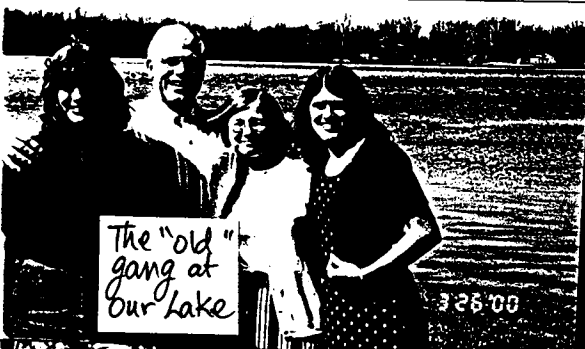
The "old" gang at our Lake