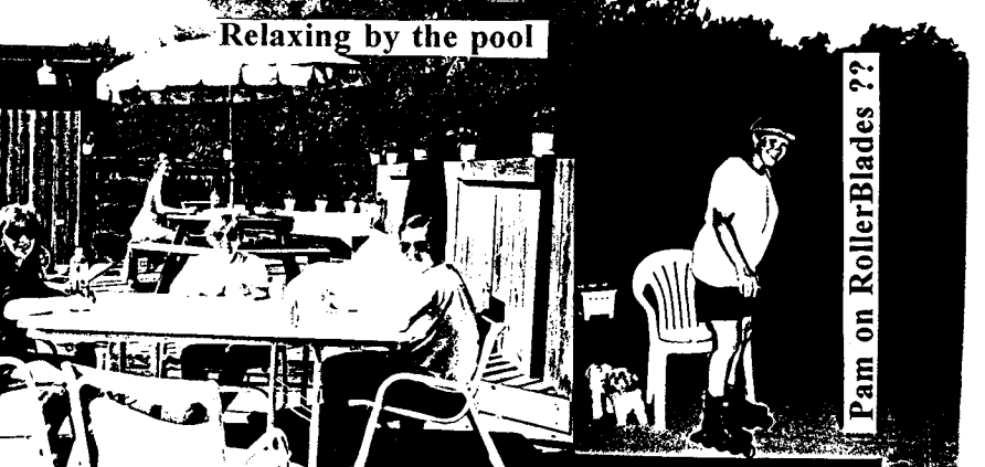
Relaxing by the pool