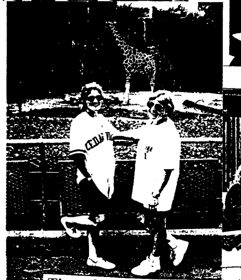
Three beautiful animals