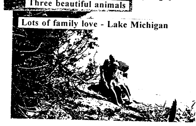
Lots of family love - Lake Michigan