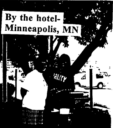
By the hotel- Minneapolis, MN