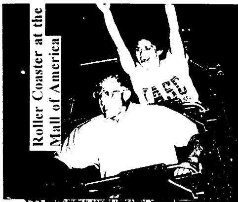
Roller Coaster at the Mall of America