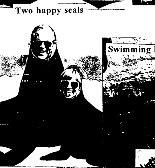
Two happy seals