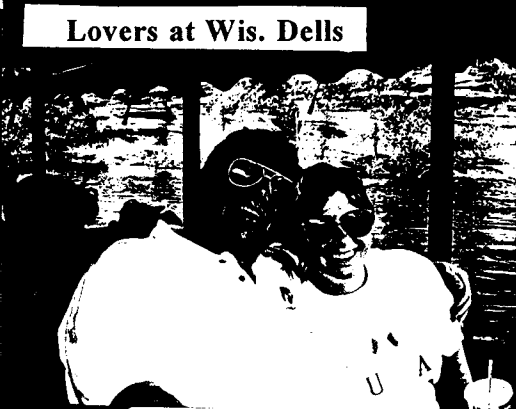
Lovers at Wis. Dells