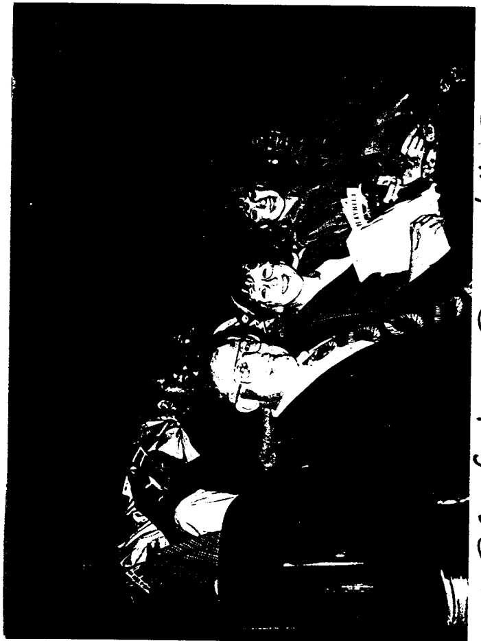
The Refor family at Beauty and the Beast